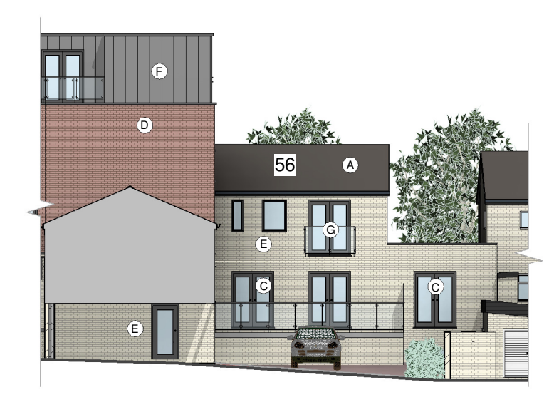
East (Front) Elevation 1:200